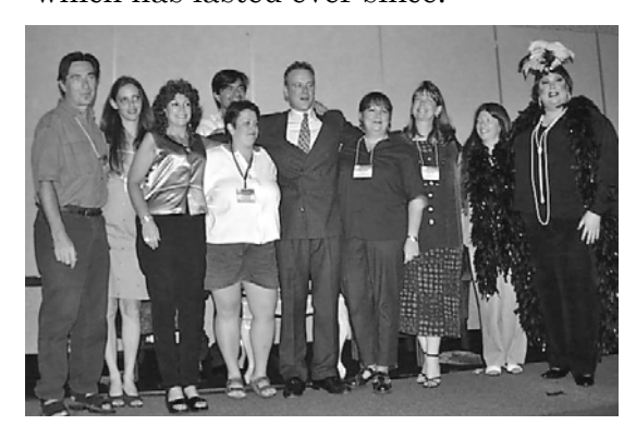
Quiz Show Participants at Clair de Lune

The Primordial Crooze was a period of internal strife that was echoed by the overly choppy seas. But three month's later, in June of 1999, "The Grand Investiture" at Medieval Times felt creatively and organizationally redemptive. 800 HKer's cheered on their knights and watched the medal ceremony, which admittedly seemed to last as long as The Academy Awards, but what a grand evening we all had. And Clair de Lune, in June of 2000, marked in my mind the first true collaboration between HBC and HOP, which has lasted ever since.