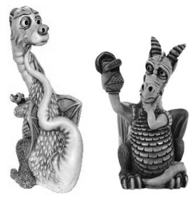
Love Birds or Sparring Partners???

from a signing tour, and I got a bit carried away!". Her husband declined to comment but was heard whistling 'Love Me Tender' as he hobbled back into the house.